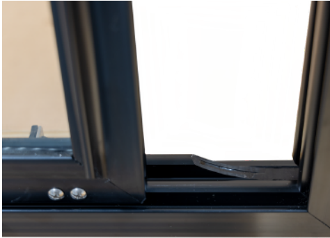
Slider Track Channel