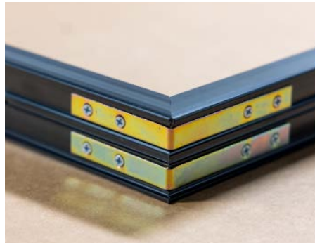
Frame Corner Key