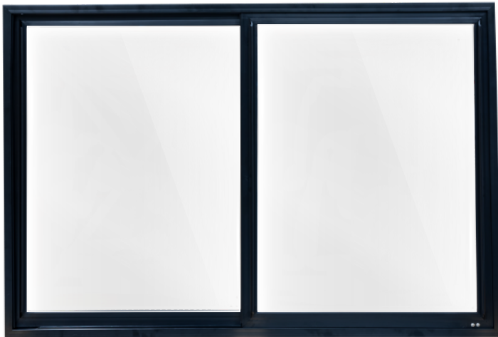
Slider with Glass Pack Door Clear / Low-E and Reflective (NON-Heated)

Sliders are available with solid composite door and glass pack.