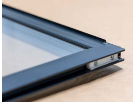
Slider Track Guide