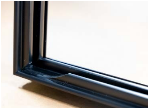
Slider Track Channel