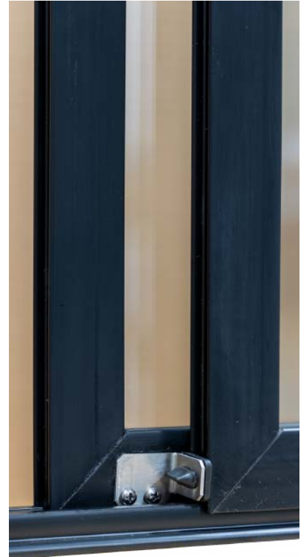
Slider Door Stop