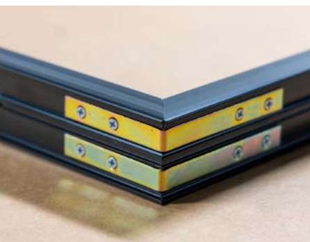
Frame Corner Key