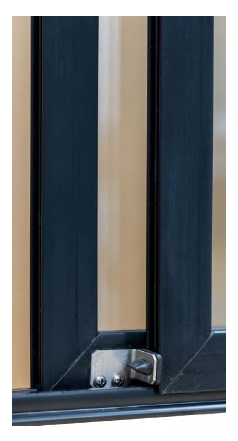
Slider Door Stop