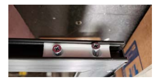
3. Install screws into the bottom door glide