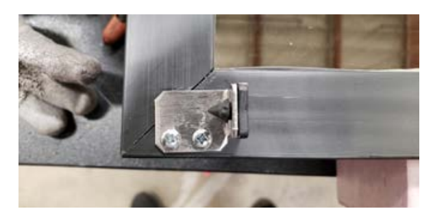
4. To remove door stop, remove both Phillips head screws this will also allow you to remove other door glide