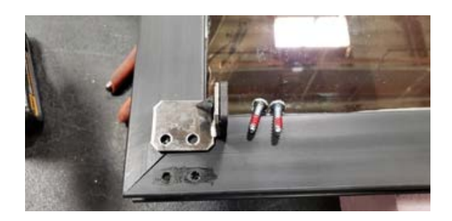
5. Picture of new door stop and screws