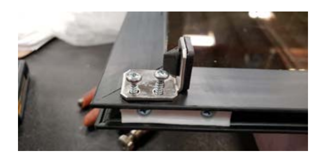
6. Install door stop and screws in reverse order