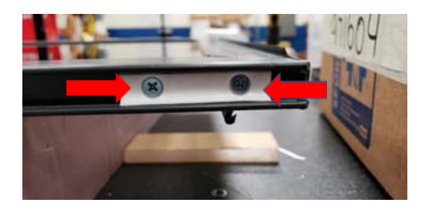
1. Remove both Philip pan head screws holding glide

If after performing cleaning maintenance per above and still door is too hard to open/close it may be caused by worn out glides, see below: